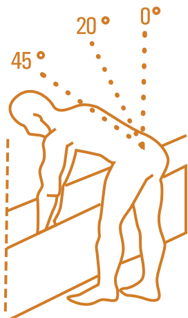
Avoid excessive bending (more than 45°).