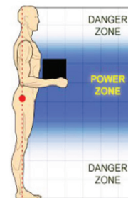
Lift in power zone—avoid back injury.