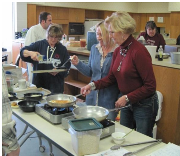
Staff preparing their own lunch using the Chef's ingredients.